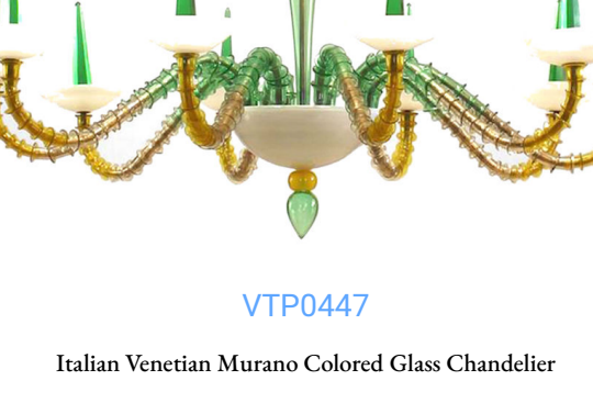
VTP0447 Italian Venetian Murano Colored Glass Chandelier