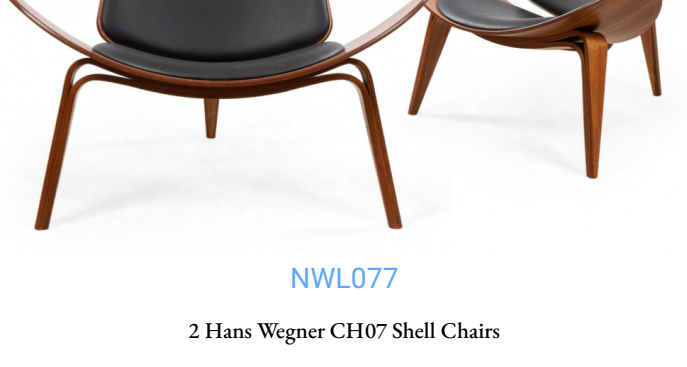
NWL077 2 Hans Wegner CH07 Shell Chairs