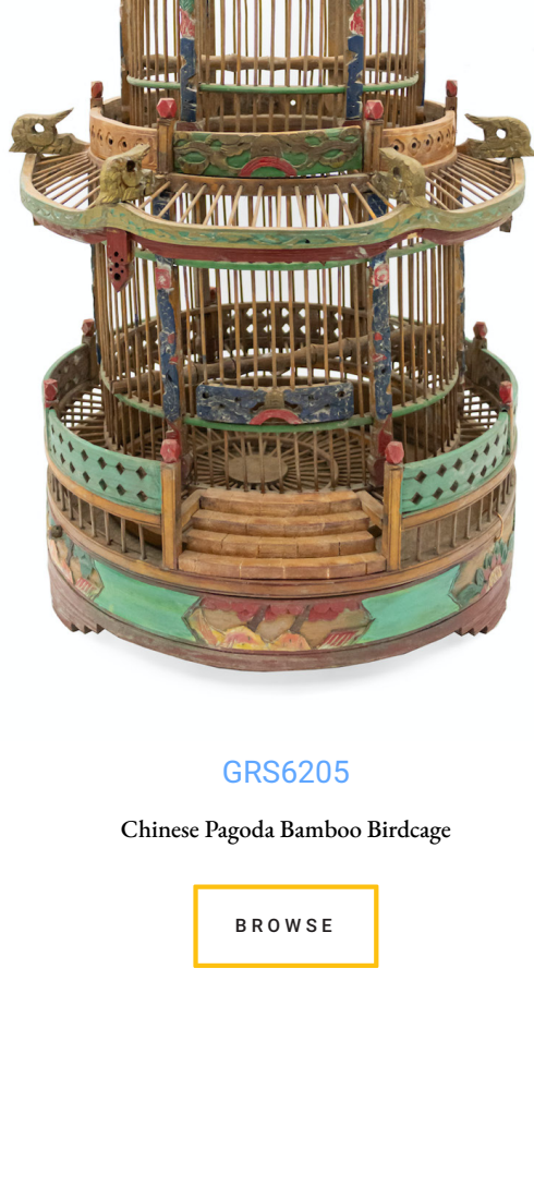
GRS6205 Chinese Pagoda Bamboo Birdcage